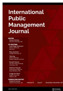
International Public Management Journal